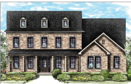
AMERICAN CLASSIC (WITH OPTIONAL DORMERS)