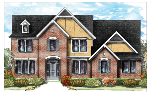
GRANDE VISTA (WITH OPTIONAL DORMER)