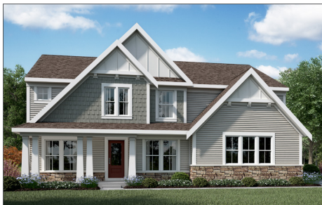
COASTAL CLASSIC (WITH OPTIONAL STONE VENEER & OPTIONAL SIDE ENTRY GARAGE)