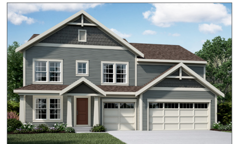
WESTERN CRAFTSMAN (WITH OPTIONAL THREE-CAR INTEGRATED FRONT ENTRY GARAGE)