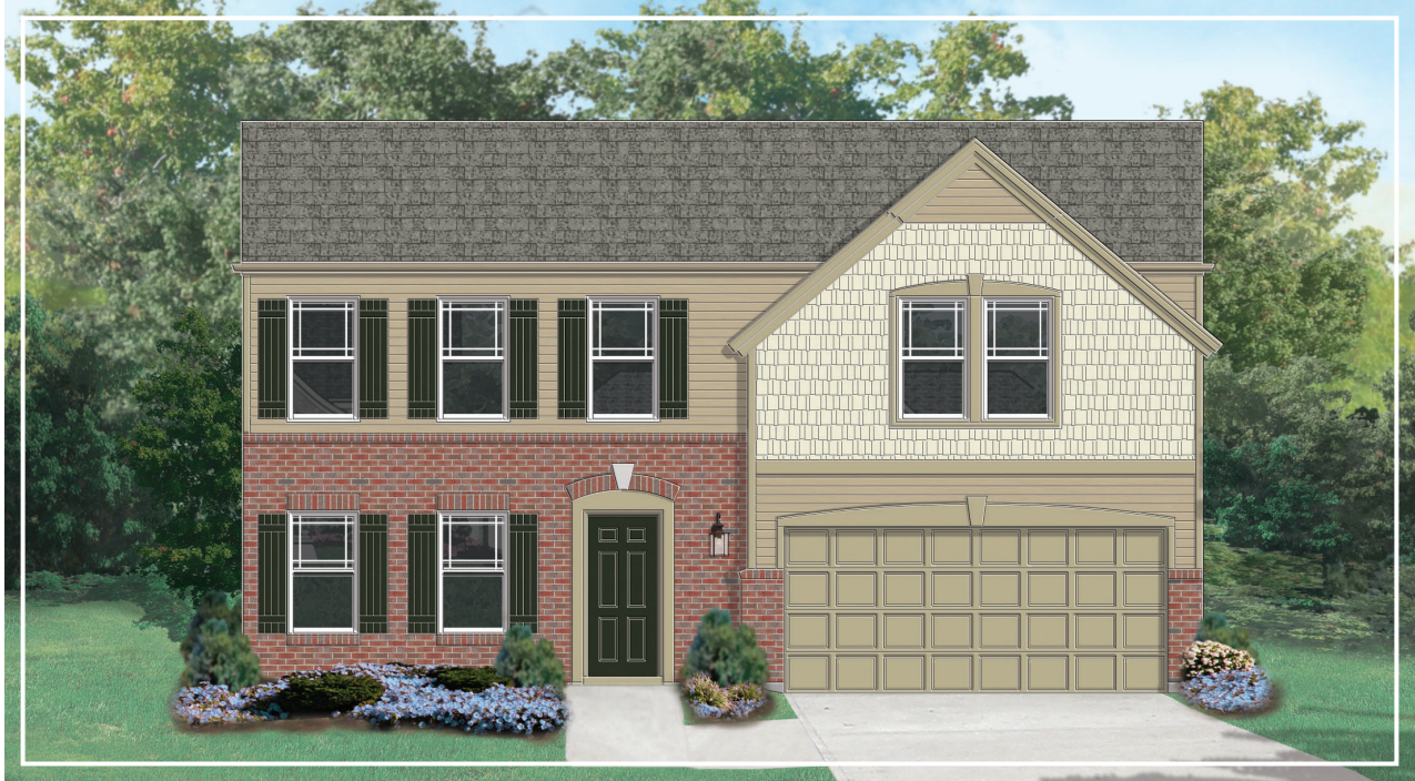
ARTS & CRAFTS F (SHOWN WITH TRADITIONAL PAINT SCHEME)