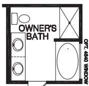
PARTIAL SECOND FLOOR DESIGN W/OPT. OWNER'S BATH