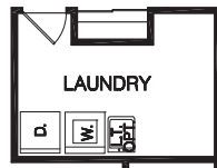
PARTIAL SECOND FLOOR DESIGN W/ OPT. BASEMENT NOTE: HVAC AND WATER HEATER MOVES TO BASEMENT